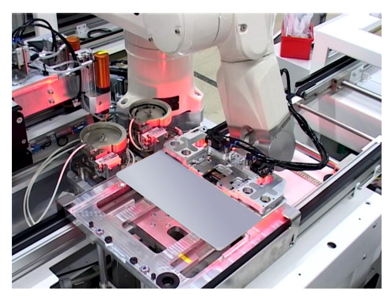
Photo 1: Two laser sensors measure the depth of the touchpad pocket on a notebook housing.