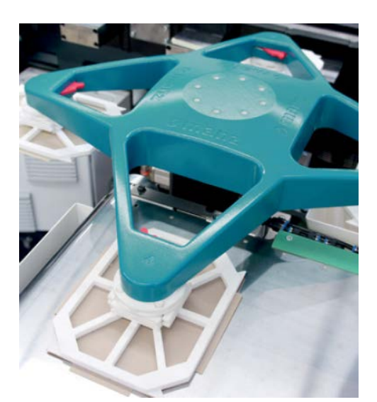
Image 3: the Modular Stacking Machine from Manz provides consistently high availability thanks to redundantly designed material feeds and enables a variety of cell geometries.