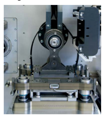
Image 1: the processing module of the Highspeed Notching Platform from Manz is a master of a variety of notching processes – by means of mechanical or laser cutting.