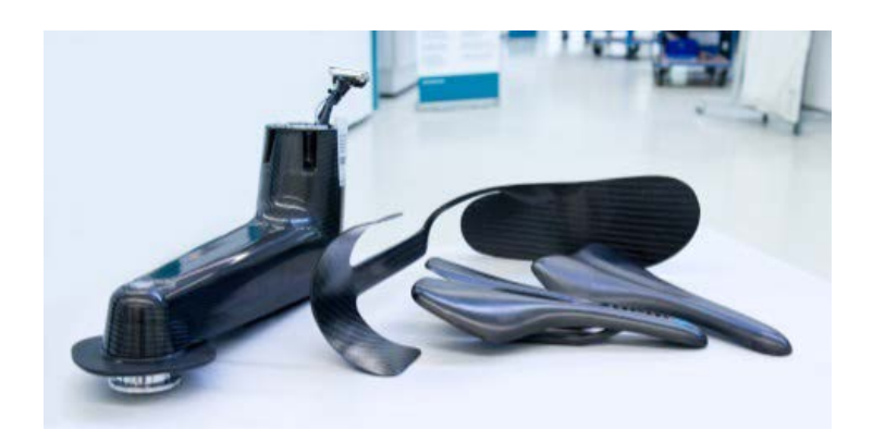
Photo 2: Patch placement in practice: hobby road cyclist Achim is measured in his bike shop using a scanner in order to determine his ideal seat position on his bike. This also includes data on weight and the spacing between his pelvic bones. This data is transmitted immediately to production to manufacture Achim's perfect carbon saddle via patch placement – the saddle is ready to ship just a day later.