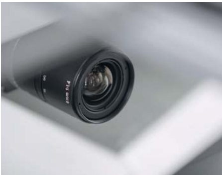
Integrated measurement technology