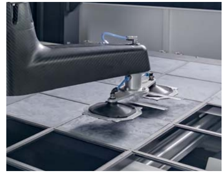
Contactless automation with the Bernoulli double gripper