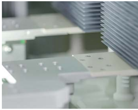
Slider system for vacuum transport